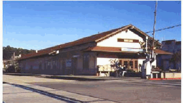
Southern Pacific 1258